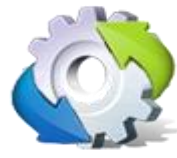
Functional Level Access