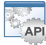
Integration API's Support