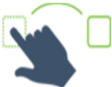
Form Designing (Drag / Drop)