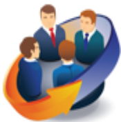
Real Multi-Users Application