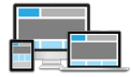
Tab & iPad compatibility